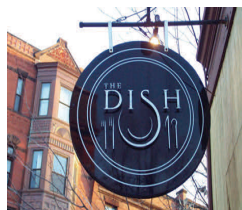
Replace Signage, Install Awnings, Paint, and Repairs.